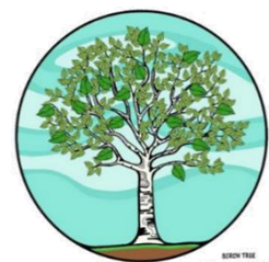
LAND LESSON PLANS BEGINNER: GRADES K-3 www.indigenoussheroes.ca