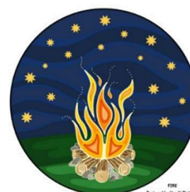
FIRE LESSON PLANS BEGINNER: GRADES K-3 www.indigenoussheroes.ca